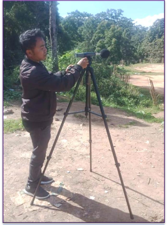
Monitoring of noise using Sound level meter