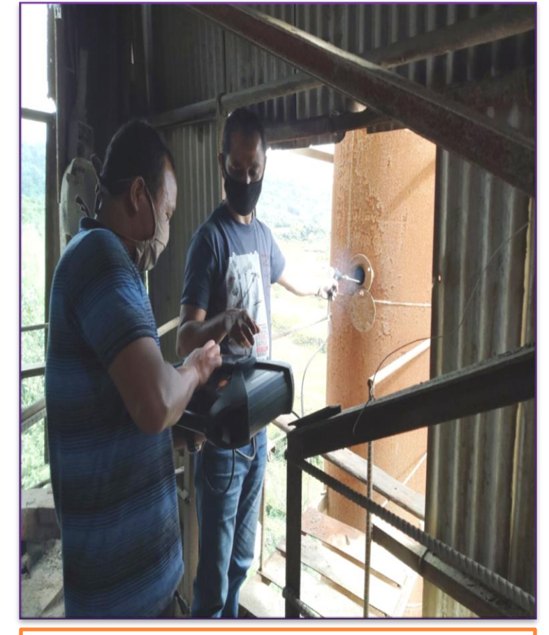
Stack emission monitoring using portable Flue Gas Analyzer at EPIP, Byrnihat