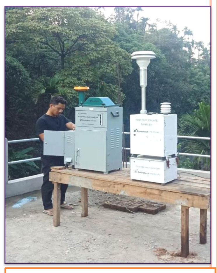
Manual Air Quality monitoring Station at Byrnihat